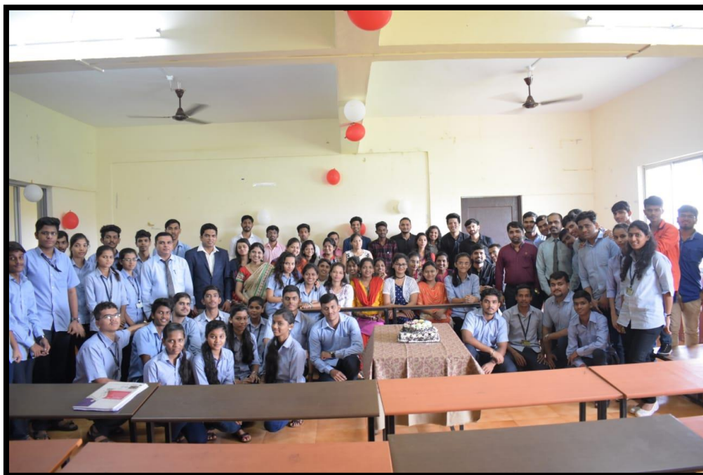
Alumni Meet 03rd October 2018