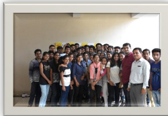
Visit to Radio Mirchi Kolhapur