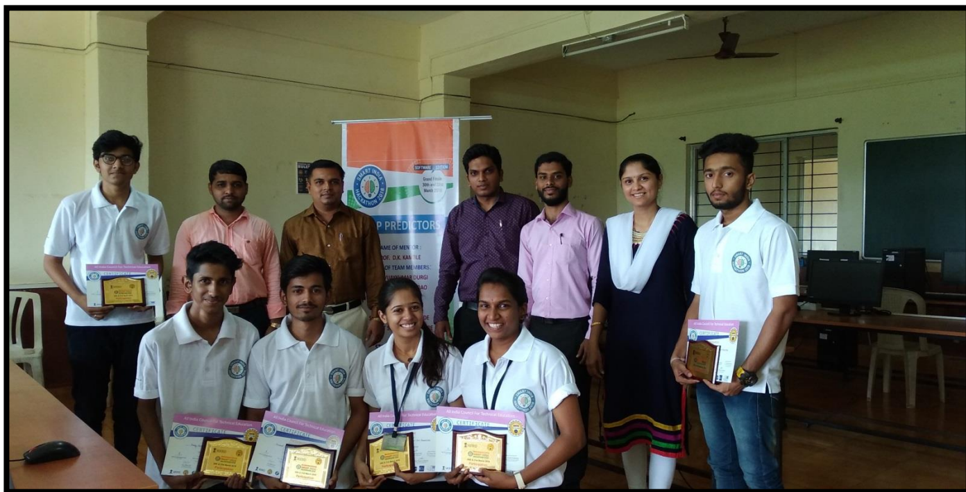
Smart India Hackathon 2018 Team