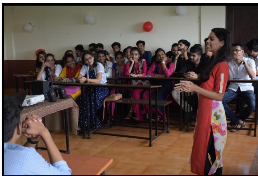
Alumni Sharing Their views