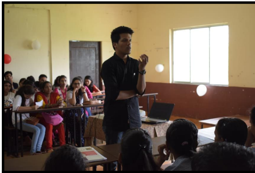
Alumni Sharing Their views