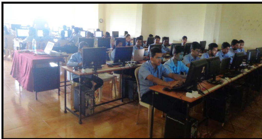
Computer Engineering Lab's